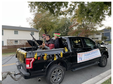
Jazz Band on the Move!

“Even though our truck had a dead battery when the parade was ready to go, we kept an Optimistic attitude and found a lovely woman who lent us her car to jump the battery and off we went. It was a great night! A special thank you to the JMHS Jazz Band students who played for us. ”