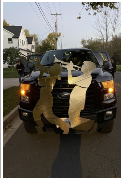
The Jazz Truck